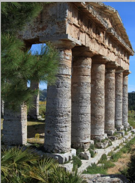
Greek Temple at Segesta