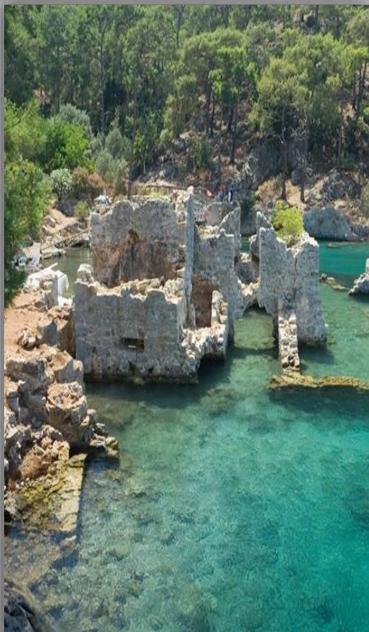
Ancient city of Phaselis