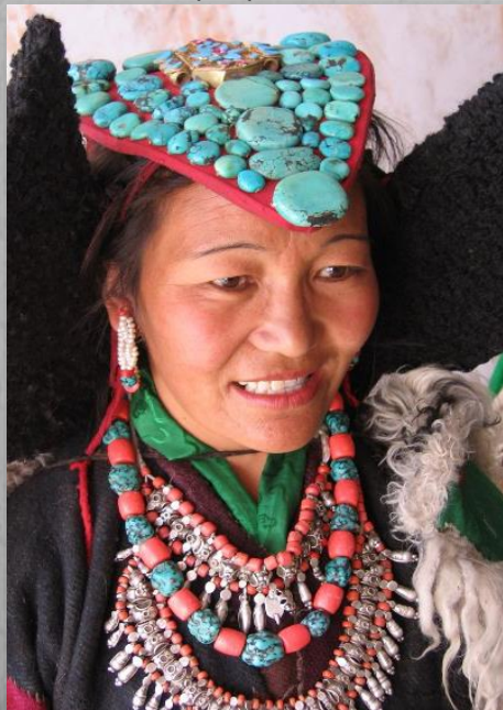
Turquoise stone headdress, Ladakh woman

Cost £2295.00 per person in a twin room (excluding international flight to Delhi) Single supplement £400.00